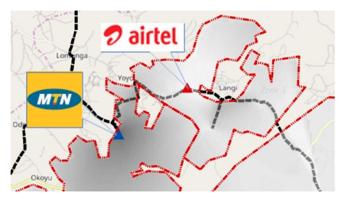
Figure 4: Natural Neighbor interpolation map of cellular signal strength (RSSI), MTN 3G, in the northern section of Zones 3, 4, and 5 of the Bidi Bidi Refugee Settlement.