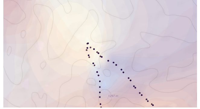
Figure 5: Illustration of a 'cold spot' in network coverage, interior of the Rwamwanja refugee settlement.